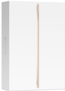
iPad Air 2 retail packaging uses a minimum of 38 percent post-consumer recycled content.