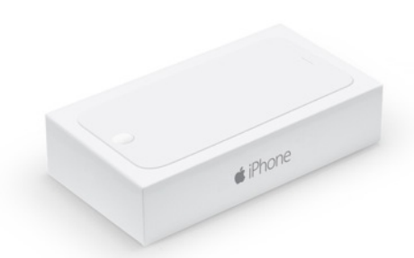
U.S. retail packaging of iPhone 6 Plus is 3 percent lighter and consumes 13 percent less volume than the first-generation iPhone packaging.