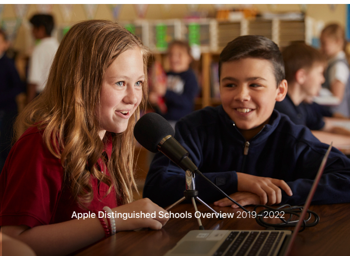
Apple Distinguished Schools Overview 2019–2022

Apple Distinguished Schools are willing to engage in Apple-hosted school site visits, publish the school's success story, and share best practices and evidence of student academic success.