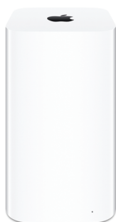
Models ME918 Date introduced June 10, 2013