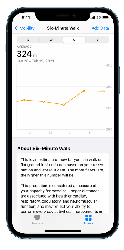
Figure 1: Estimated six-minute walk distance in the Health app in iOS 14

Apple's HealthKit API allows users to share this information with apps installed on iPhone using Apple's HealthKit API.<sup>9</sup> Each estimate has accompanying metadata that reports the device calibration status, which may impact estimate accuracy and is described further in the discussion. This metadata is included when other apps access estimates using the HealthKit API.