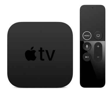
Models MQD22, MP7P2