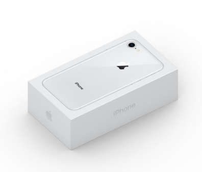
U.S. retail packaging of iPhone 8 contains 79 percent less plastic than iPhone 6s packaging and contains 59 percent recycled content.